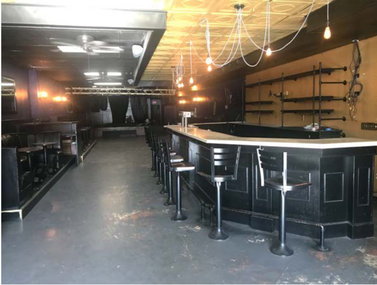
Bar with taps