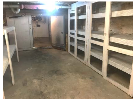
Basement: Walk in Cooler

One of the few remaining liquor only licenses left in downtown Lawrence