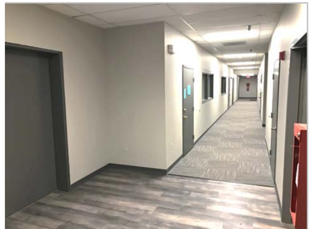
Elevator & Hallway